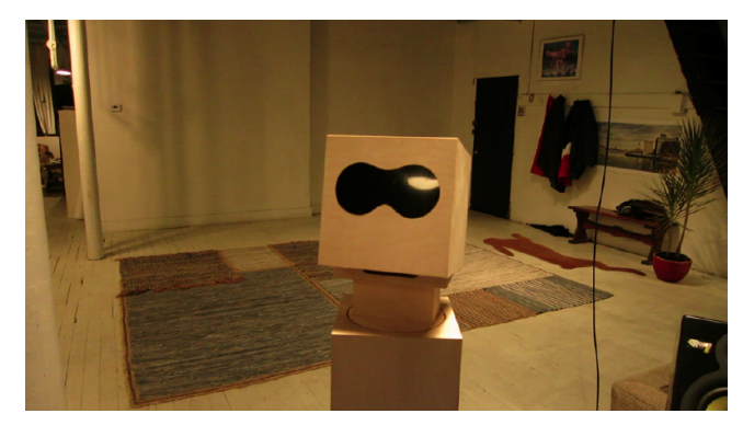
Figure 1. Cloud Rhymer robot

IDC '13, Jun 24-27 2013, New York, NY, USA ACM 978-1-4503-1918-8/13/06.