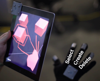
a) Collaborative 3D manipulation and animation in the physical space. b) Gesture space c) VR viewport and pinch mapping