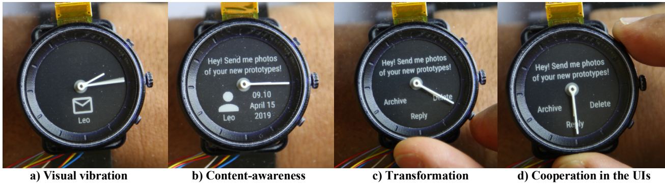
Figure 1. Our hybrid watch user interfaces (UIs) leverage coordination and collaboration between steerable physical hands and a dynamic watch dial. Hands and dial transform and cooperatively form new interfaces that leverage their respective strengths. a) The physical hands vibrate mechanically on a new message. b) The hands fold and move out of the way for text. c) and d) Steerable physical hands are used for menu selection to optimize responsiveness and to reduce power consumption.

Interaction Lab, Google Inc. Mountain View, CA 94043, USA olwal@google.com